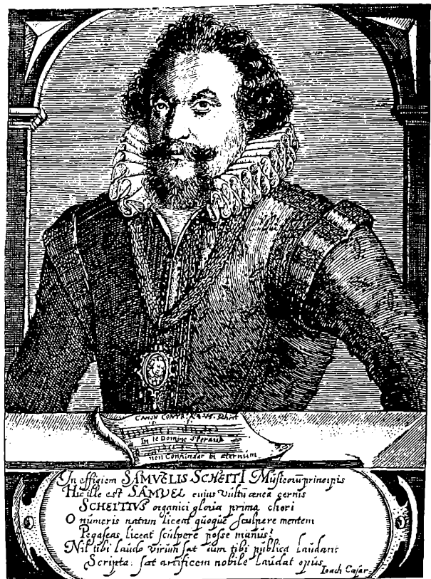
This woodcut, at the beginning of Part I, is the only surviving likeness of the composer. The music is a four-part canonic setting of "In te, Domine, speravi."

Nevertheless it would be misguided to ask whether Scheidt's organ music must to be playable manualiter in order to be faithful to the composer's intention. All the above assertions cannot and should not be understood as nullifying Scheidt's registration indications. The uniqueness of Scheidt's organ works, in comparison to those of north Germany, may be understood in this way: Scheidt's do not presuppose the rich tonal possibilities of a large organ (as do north German works) by requiring them. This, however, does not prevent the organist from exploring