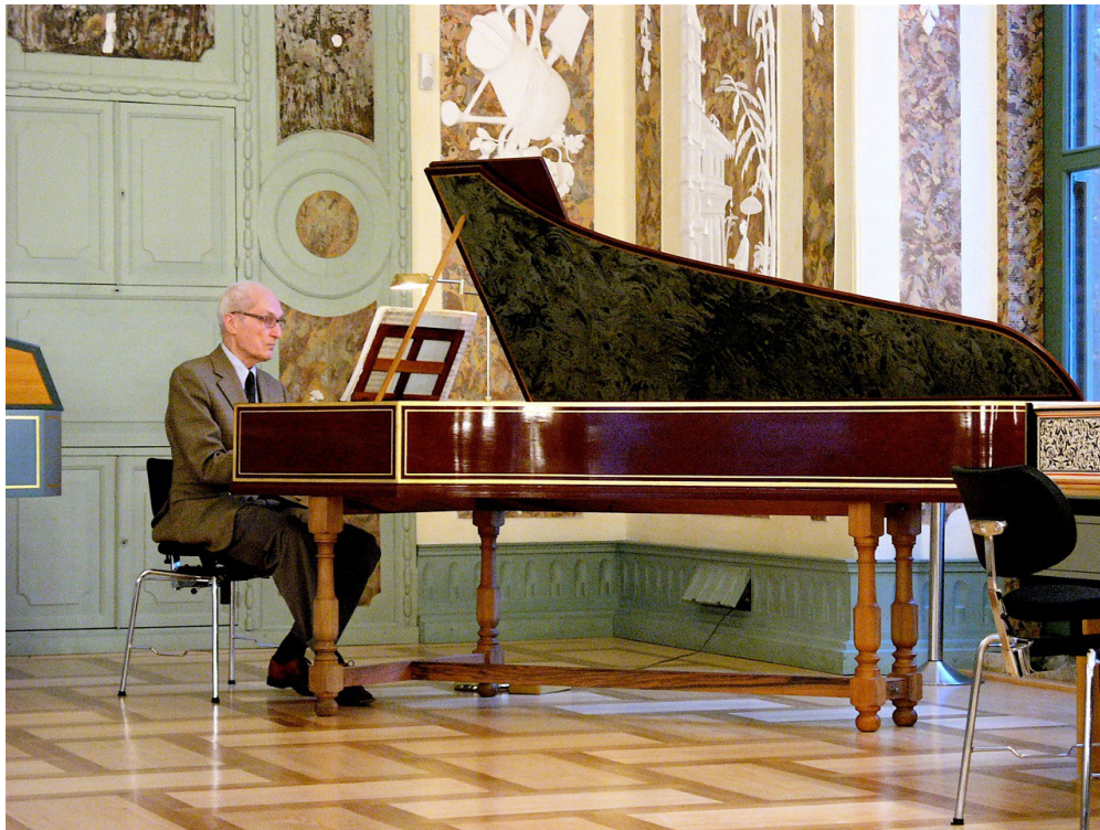
Gustav Leonhardt at the “Bagno” in Steinfurt, Germany. Photo by Ketil Haugsand, 13 Jan 2007.

Leonhardt homed in on how the notes start, on the attack (which he likened to the variety of consonants available in a language, noting that the “vowels,” or the way the notes were sustained, were mainly the responsibility of the builder); but he also insisted incessantly that I pay more attention to how the notes end, that is, to my conscious control of the dampers. His masterly demonstrations of varied ways to control resonance were transformative, as was the simple basic advice “as you play a chord, so you should normally release it” (except in special circumstances). Many players, even today, break almost all their chords, simply rolling them upwards as they play the notes, but then almost always release all the notes together, paying scant attention to controlling the subtle effects of the damping. Leonhardt demonstrated first