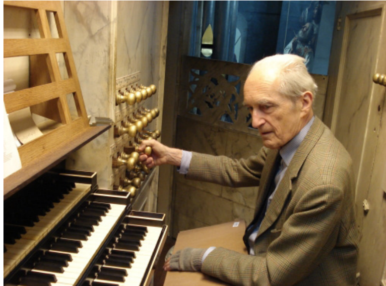
Gustav Leonhardt at the organ of the Nieuwe Kerk, Amsterdam, May 2008.

Although Leonhardt appeared to be a conservative person in his dress, language, and manners, his musical message was not conservative. His lifetime corresponds to a period of radical changes in styles of musical performance. These changes, of which he was so formidable an agent, were more reformation than revolution, and indeed he had more sympathy for the sixteenth-century Reformation of Calvin and Zwingli than for the Enlightenment or the French Revolution. His demeanor was regularly referred to, even in some obituaries, as being that of a “Calvinist pastor”; this happened so often that the image has almost become a trope. He was a leading reformer, protesting against stylistic abuses while pointing out a new way “forward to the past.” It is hardly original to note that his musical views were in many ways comparable to the religious views of sixteenth-century reformers; his musical positions were in harmony with—or, more likely, a direct product of—his own private worldview. They meshed seamlessly with his